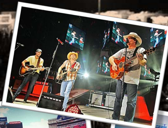
Tracy Lawrence, Luke Bryan and Jason Aldean