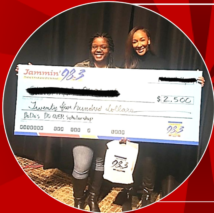
DeDe visits your market and interacts with the audience