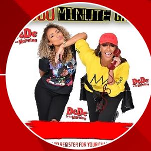
$1000 WIN GAME