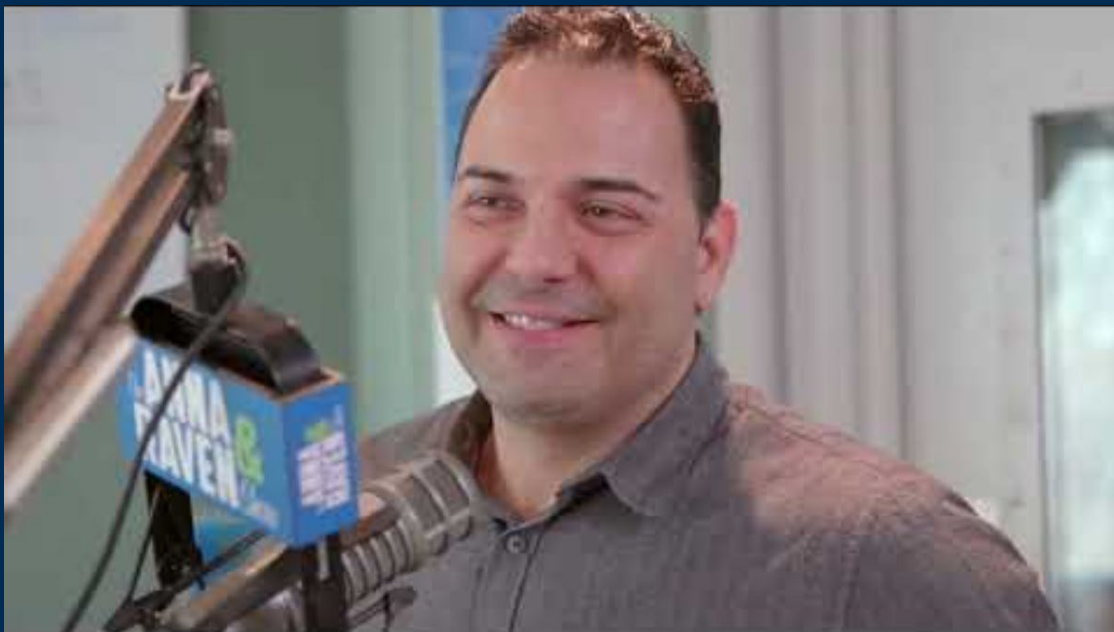
Show Promotional Video