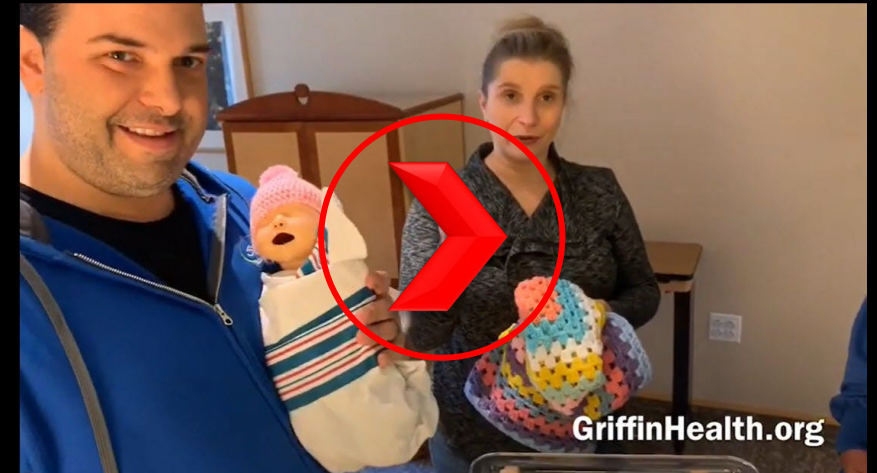
Checking Out The Childbirth Center at Griffin Hospital, CT